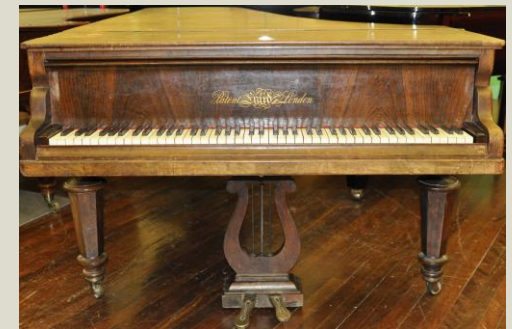
The Friends of Chopin Australia's 1857 Erard piano