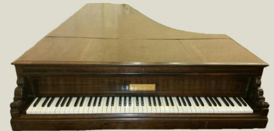
The ANU School of Music's 1847 Pleyel piano